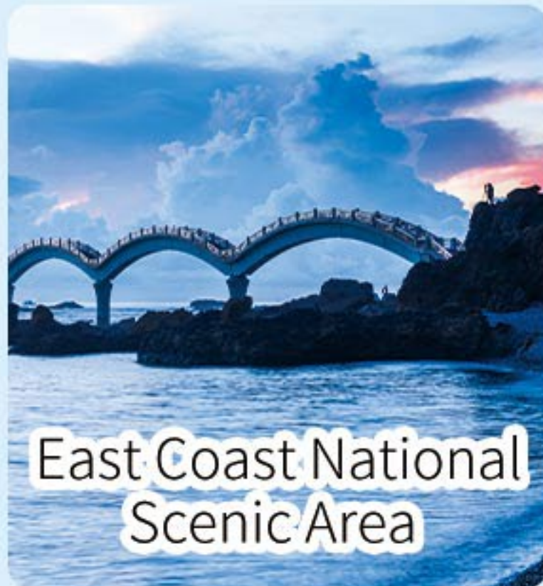
East Coast National Scenic Area

Arrange for English/Chinese (Mandarin) tour guide