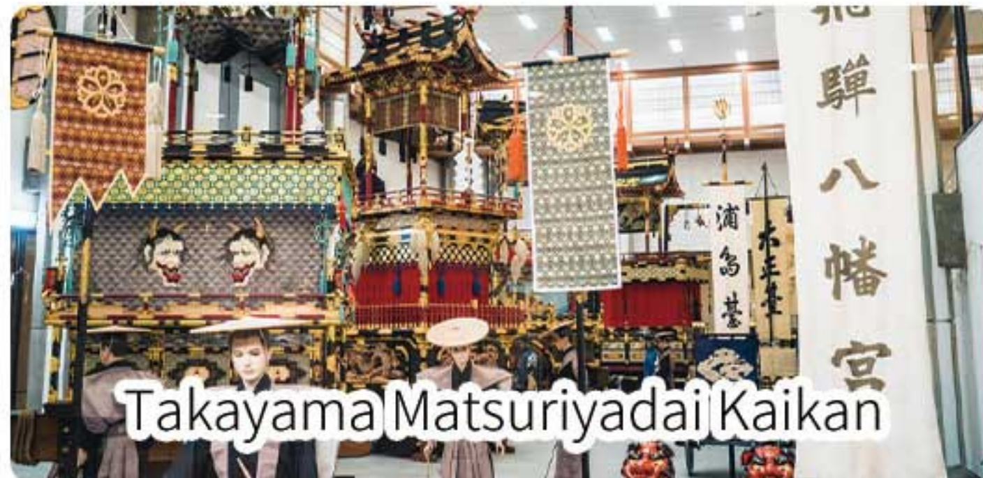
Takayama Matsuriyadaï Kaikan

After breakfast, visit the Nagoya Castle, which was the heart of one of the most important castle towns in Japan. Then transfer to Kyoto. Visit the famous Kinkakuji Temple. Afterwards, head to Gion. It is a good place to experience the ancient charm and culture of Kyoto. The Yasaka Shrine is almost always buzzing with energy, with eager devotees flocking to receive blessings and pray for good fortune. Walk on Hanamikoji, the most stylish geisha district in Japan from the Edo period. The Kamo River is a primary river flowing through Kyoto City. Dinner is on your own arrangement.